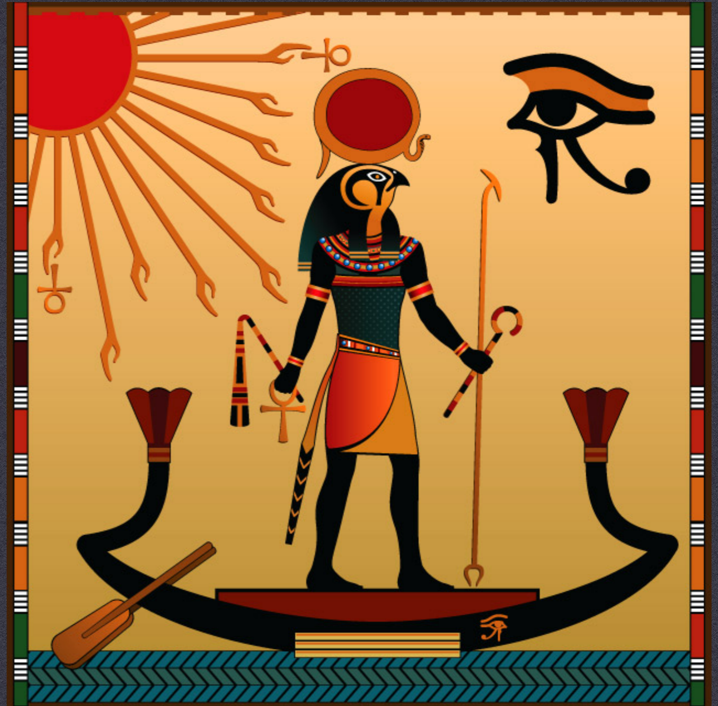
9. Ra - The Sun God

Egyptian Plague - Locusts sent from the sky