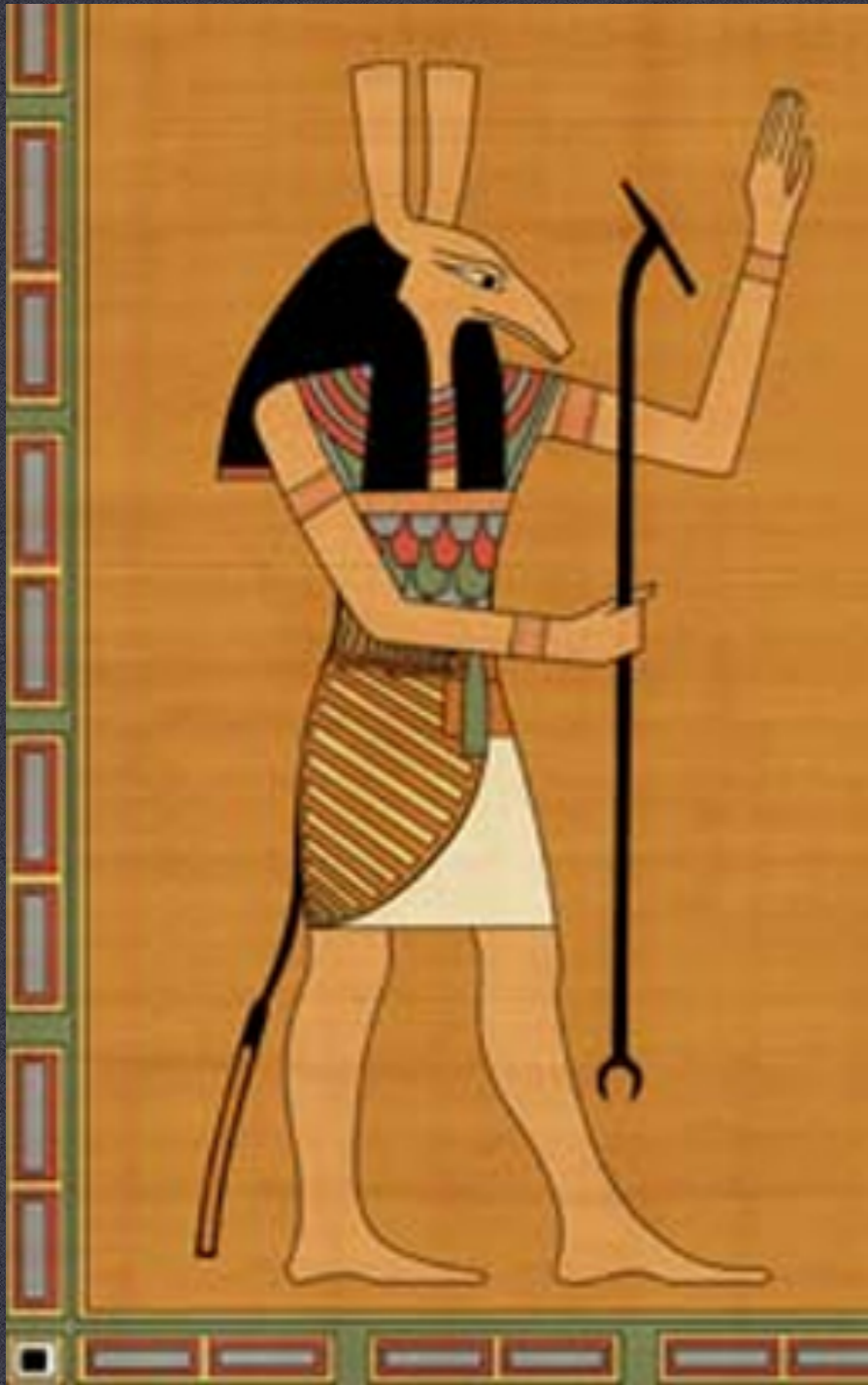
8. Seth - Egyptian God of Storms and Disorder

Egyptian Plague - Locusts sent from the sky